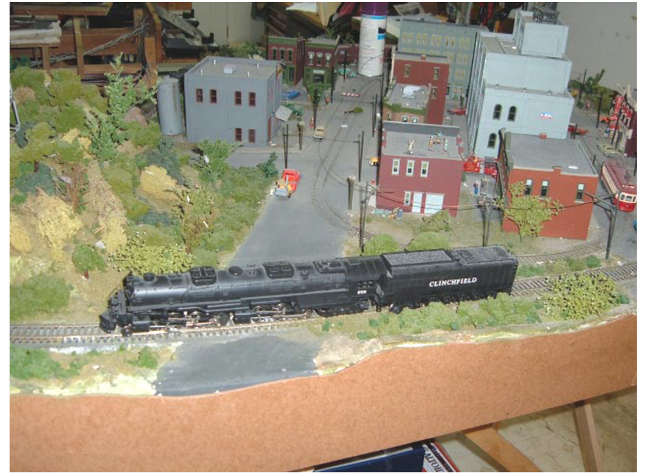
AREA "C" (BELOW RIGHT)