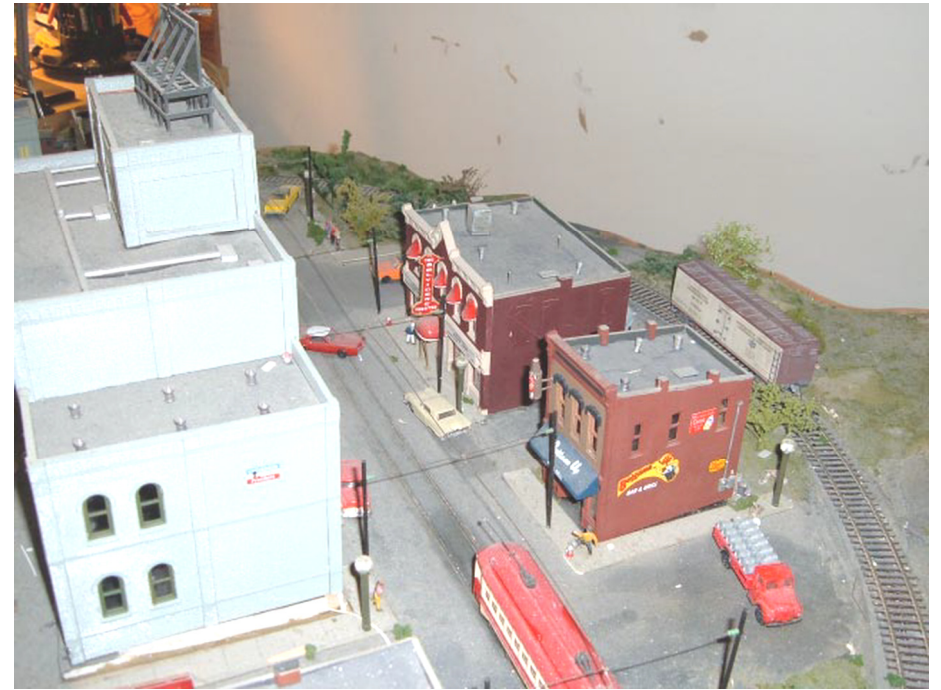
AREA "B" (ALL OTHERS)