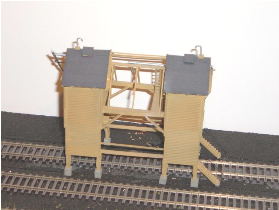
AREA "A" (ABOVE)