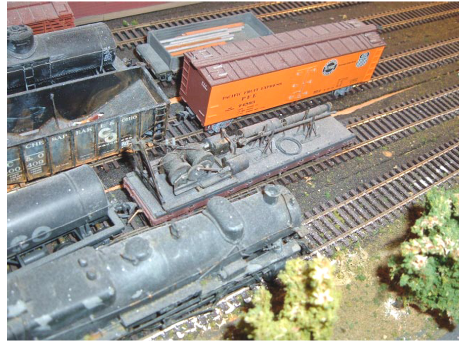
AREA "A" (ALL)