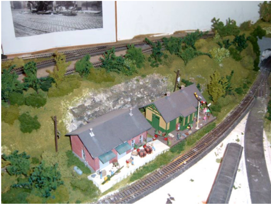
AREA "C" (ABOVE)