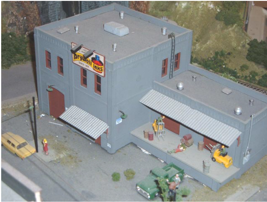
AREA "B" (ABOVE & LOWER LEFT)